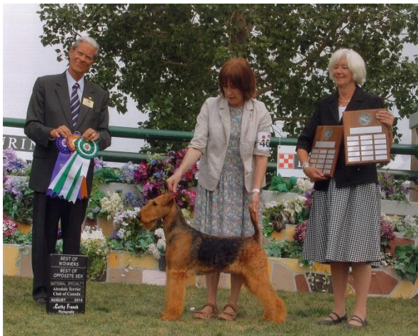
Best of Opposite Sex, Best of Winners Winsea N Brea Going Paroli