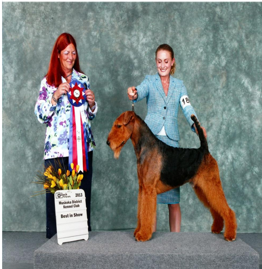
AM. CAN. GCH. WESTCHESTER HILL BOY...aka...JEB