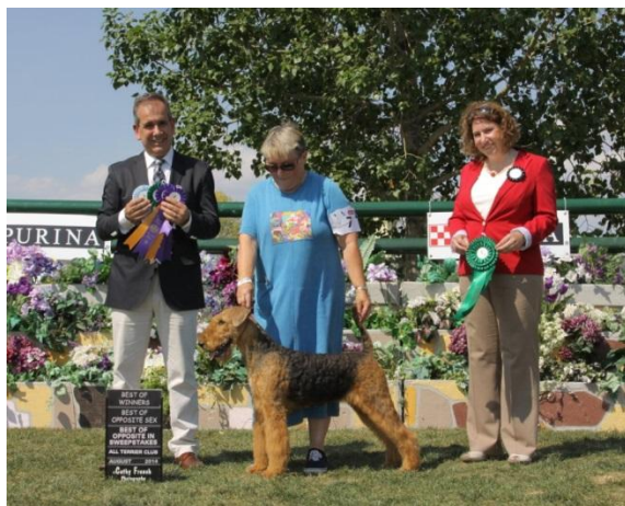
Shawndee Winter Ice Wizard