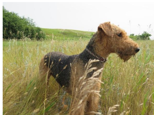
Shawndee's Troubadour CD DD RA AGNJS