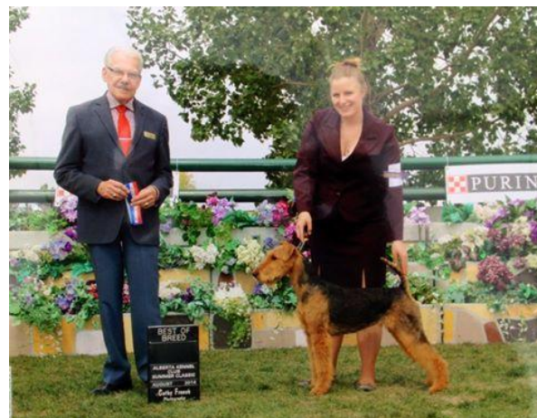
Hollytroys Just Ducky at Kitch