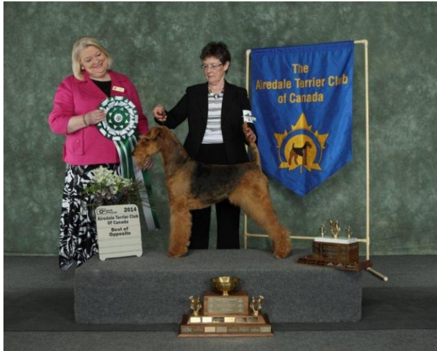
Dina ... Ch. Serendipity Wings over Hollytroy