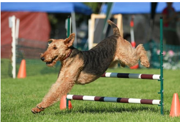
Nightsun Rising Star CDX RAE AGIS AGIJS