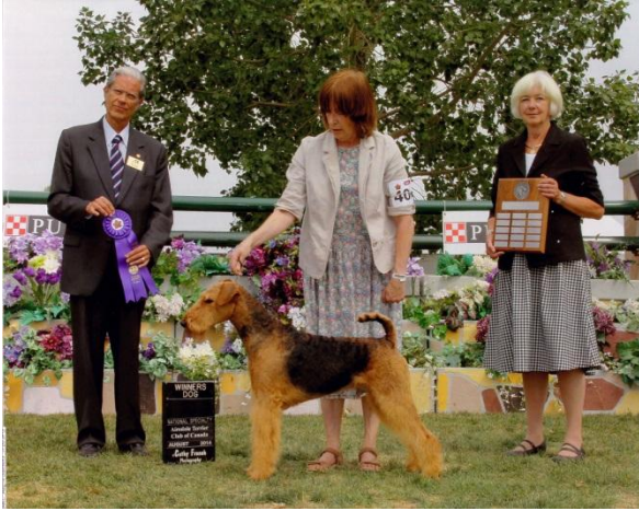
Winners Male - Monterra King of Hearts