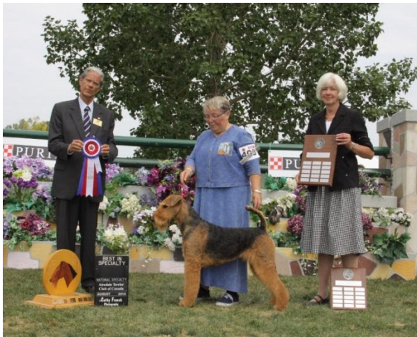
Best in Specialty, Best Canadian Bred Am Can Ch Shawndee Mutiny on the Bounty