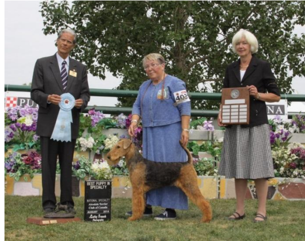
Best Puppy – Shawndee Winter Ice Wizard