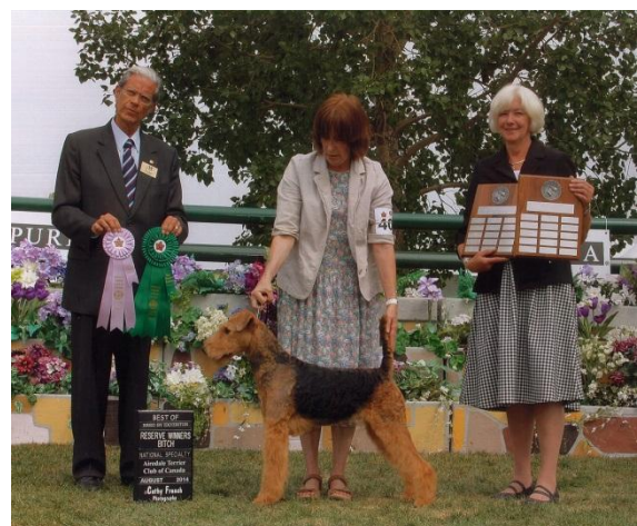
Reserve Winners Bitch, Best Bred By Exhibitor Brea’s Xpecting to Fly